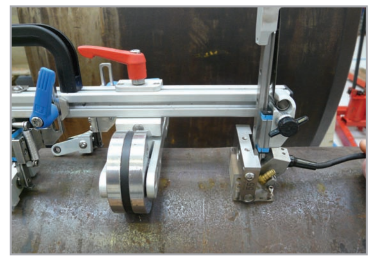
MultiMag with 1 x phased array probe for pipe-to-fitting inspection